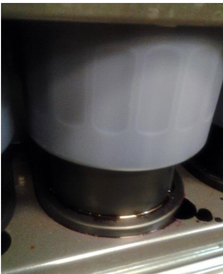
Ink Bottle in nest with leaky cap